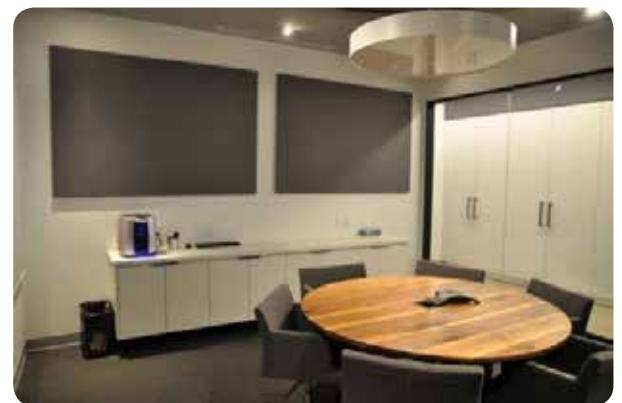
Available Color Tones